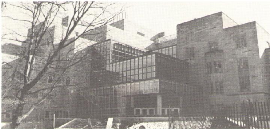
JORDAN HALL ADDITION