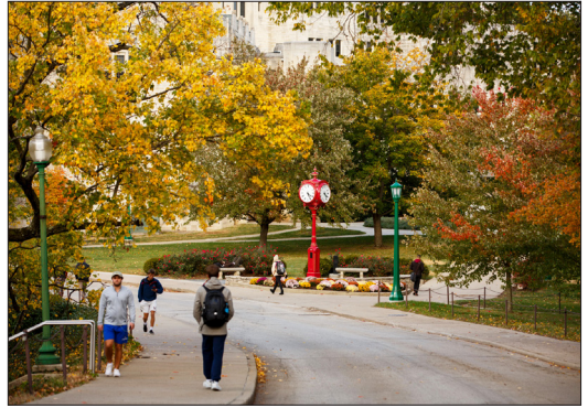
▲ IU Bloomington projects a record-breaking class of incoming students in the fall.

Because IU Bloomington remains a primarily residential campus, the Department of Biology is eager to increase the number of in-person courses and resume standard administrative operations for fall 2021. Despite overcoming the many obstacles and challenges from COVID-19—though in some cases innovative and exciting contributions were achieved—nothing compares to being able to instruct, mentor, and support our undergraduate and graduate students through face-to-face interactions in class, lab, and beyond. Further, having the physical presence of our staff, many of whom have been working remotely for the past 16 months, will be a welcomed change. Along with students, their presence will certainly help counteract the stillness of